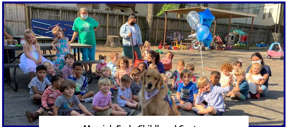
Messiah Early Childhood Center

"Bless the Lord...who satisfies you with good so that your youth is renewed like the eagle's." Psalm 103:5