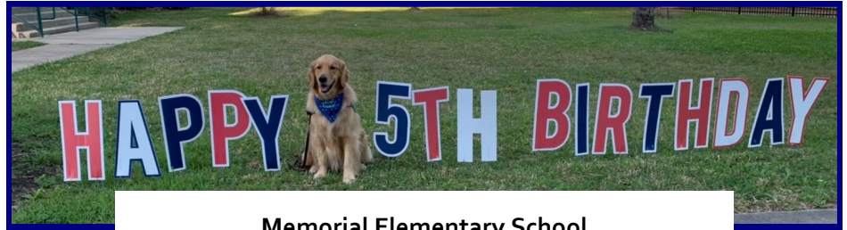
Memorial Elementary School